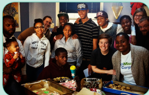
The Youth Council baked and delivered over 800 Christmas cookies to more than 60 neighbors.

These 12 teenagers are learning about and practicing leadership in our community. From planning neighborhood beautification projects and community events to identifying key problems and working with law enforcement and elected officials to find solutions, the TNT Youth Council members are developing their leadership skills, public speaking abilities, and self-confidence in representing their community before others. For most, this is their first leadership role. For us, it is a partnership with young people who share the vision for building a strong community.